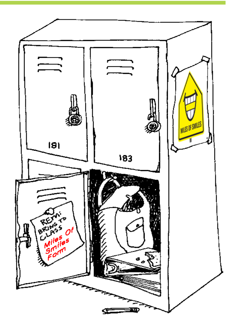
Send Miles of Smiles forms home with your students today!

We value and encourage those with a dental home to seek their oral healthcare there.